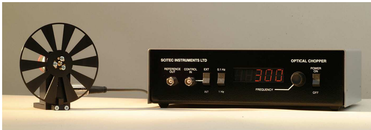
↓ Model 300CD